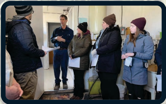
NFL Canada partnered with AITC NB to host an elementary teacher farm tour in Southern NB