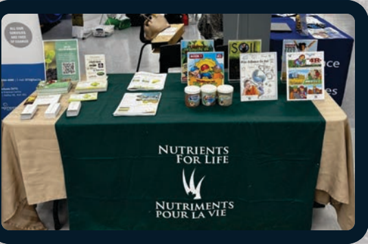
NFL Canada attended many teacher conventions across Canada to share our soil and plant science resources!